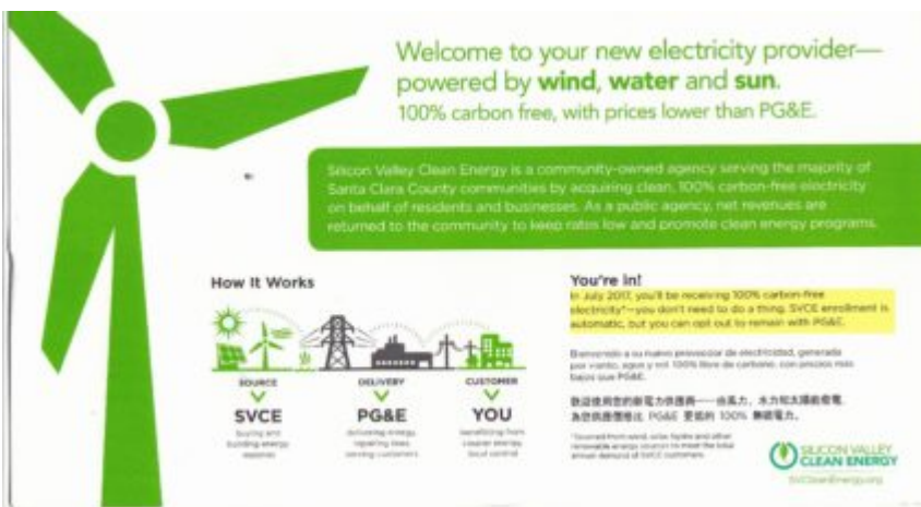
(click for larger image)