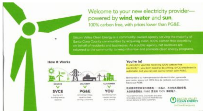
(click for larger image)